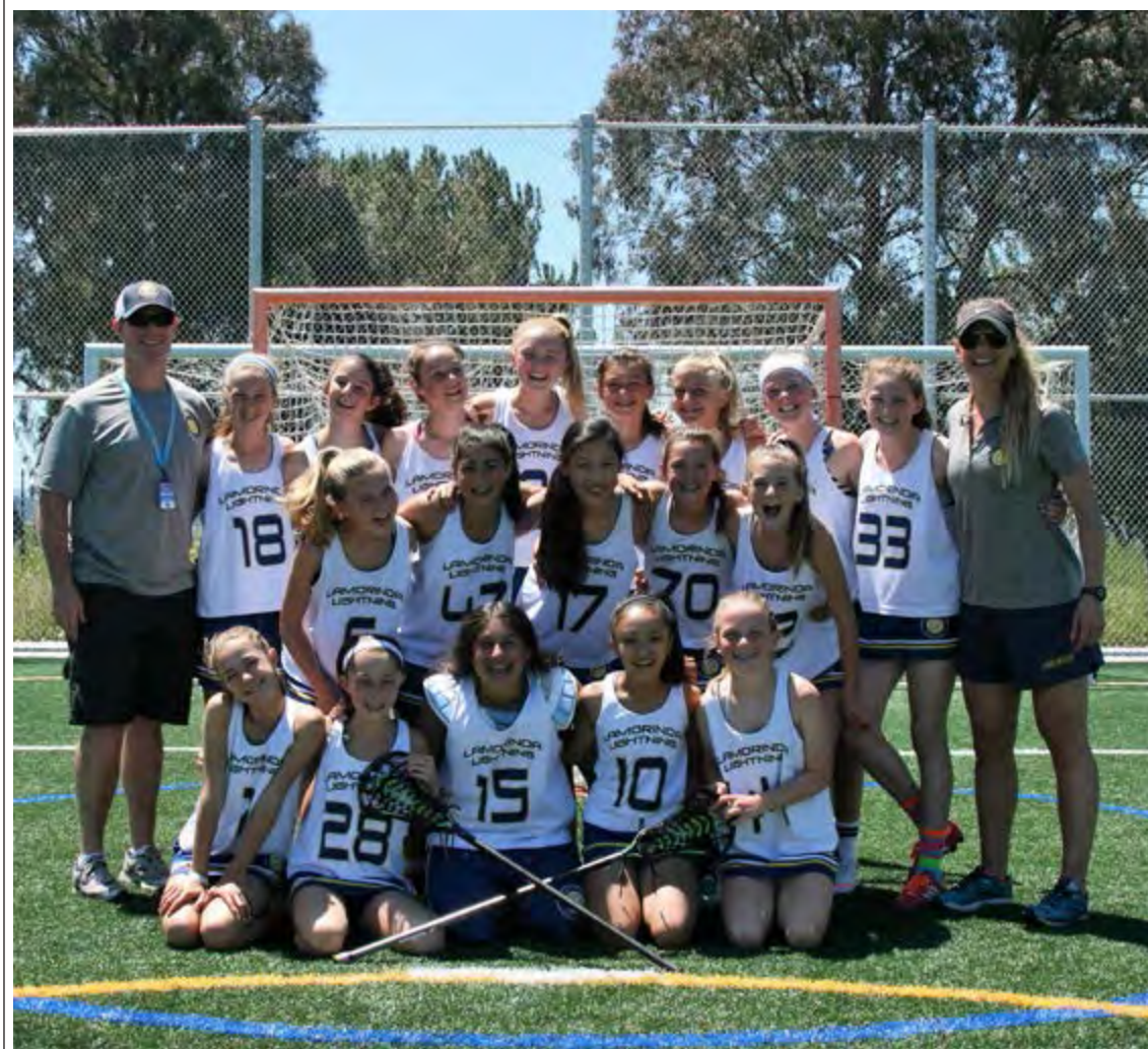
The Flash, the G13A team of the Lamorinda Girls Lacrosse Club, played in the NCJLA championship game.